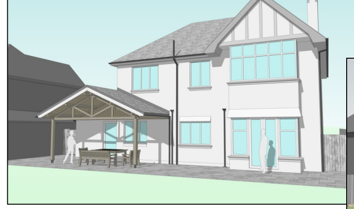
Single Storey Rear & Side Extension, Wells