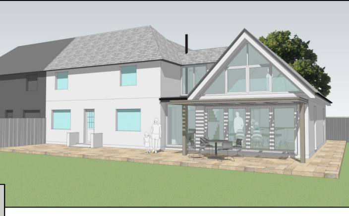
Single Storey Rear Extension, Oxford