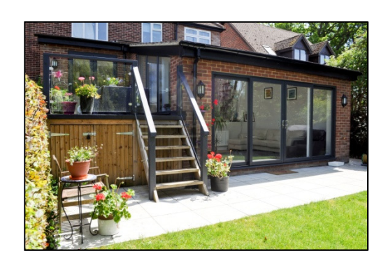
Single Storey Side / Rear Extension, Wells