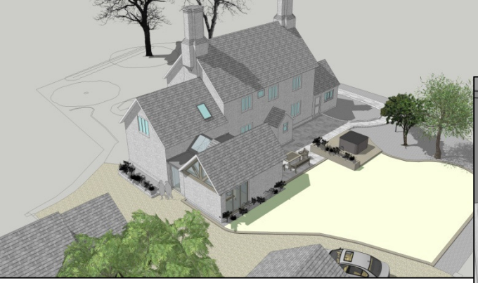
Single Storey Side Extension, Silchester