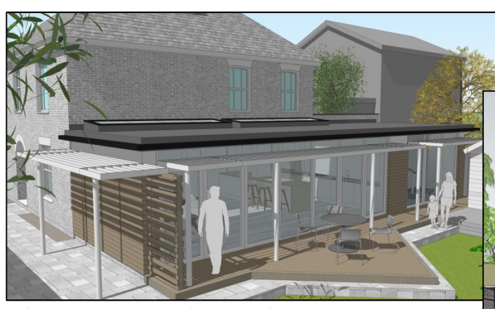
Single Storey Rear & Side Extension, Newbury